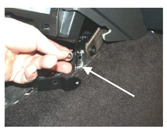
Attach frame support bracket (#4) to vehicle using 10/32 x ½" phillips machine screws, washers, and keps nuts